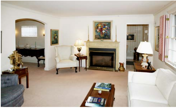
Living Room with Fireplace and Crown Molding