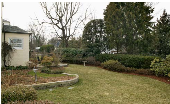
Superb Garden with Four Season Interest

Welcome to this charming brick colonial built by Cooper Lightbown in 1937 with lovely views from every window! The house has been meticulously maintained and improved by its current owner. Quality and attention to detail are evident throughout.