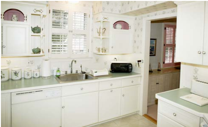
Beautifully Renovated Kitchen