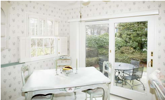
Breakfast Room Leading to Patio